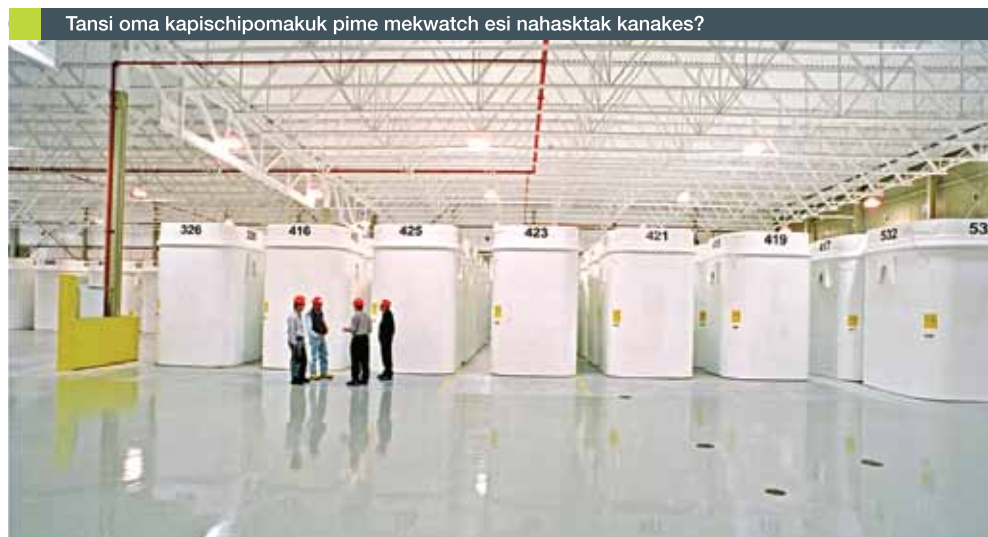
Kakisapatak pime kapastek asiwatchikuna Ontario kasokimaka sipwepayichikewin pahkisimotahk kawepinamik itotamasawin asiwatchikewkamik.