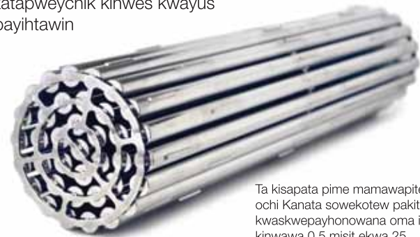
Ta kisapata pime mamawapitew ochi Kanata sowekotew pakitew kwaskwepayhonowana oma iko kinwawa 0.5 misit ekwa 25 kilograms.

Kechinahowin kinweseskumik oma pime kakisapata kakanawechikatew kakike kanakatewitamwuk ekwa kakiyow kiyanow kita kunawemayakuk ayisinowuk ekwa askiy wasakam.