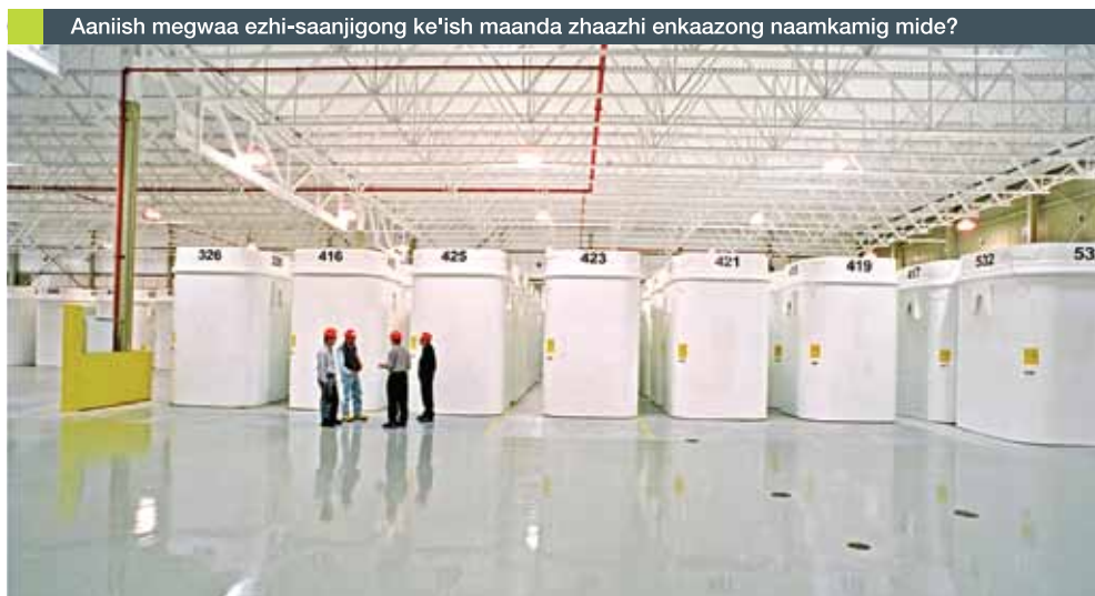
Zhaazhi enkaazong namkamig-mide ebaasjig sanjigwon kikoog odi Ontario Waasmoowin Enji-maajiging Epingishmog nikeyaa enji-aanji-nakaazong nokiigamigoong.