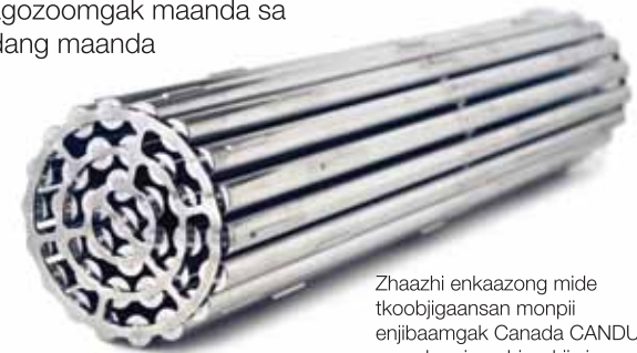
Zhaazhi enkaazong mide tkoobjigaansan monpii enjibaamgak Canada CANDU naamkamig gchi-nokiwinan megwaa 0.5 metre kwadigenan miinwaa megwaa 25 kilograms piidnigdagenan.

Gchi-piitendaagok dash gibeying, weweni ji-kowaabnjigemgak miinwaa weweni ji-gnowenjigaadeg maanda sa zhaazhi enkaasong mide ji-kowaabmin kina bemaadzid miinwaa ezhi-noojimoomgak maanda aki aabdek kiinwi kina wiikoowaabndamang.