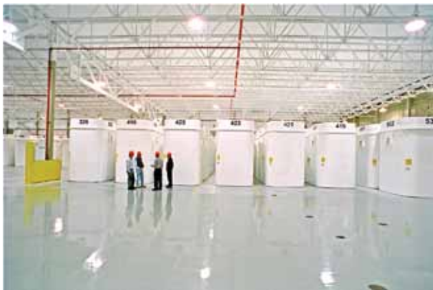
Used nuclear fuel dry storage containers at Ontario Power Generation's Western Waste Management Facility

About 85,000 used nuclear fuel bundles are produced in Canada each year.