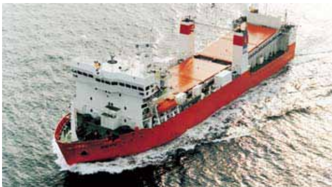
Rail car with a transportation cask used in Europe (top-left); package and trailer for road transport of used nuclear fuel (top-right). Ship for used nuclear fuel transport in Sweden (left).