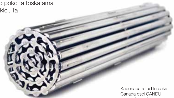
Kaponapata fuel le paka Canada osci CANDU atomic la pwal nanto piyak menapihto misit kinwawa ekwa neyananomitano kosikwana.

Tasko kotakak askiya kayacik atomic wasaskotipayo, Canada atinikan ya toskatahkwow. Les Canadien ki twiwak poko paspewin mena kwayes takanawihcicateek kaponapata atomic fuel anos mina atinikan, ekwa keyano poko ta toskatama kawyes mina kinwas kici. Ta kiscinaho kinwas kici, paspewini, ekwa kwayes takanawihcicateek kaponapata atomic fuel, aysinowak tamanacihescik asci askey yako keyano yawis pakamskakono.