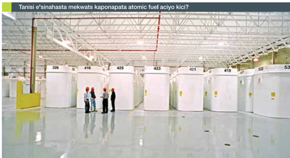
Kaponapata atomic fuel asowatew e'pasteek asowacikana ikoti Ontario Wasakotipicikanowi kamik Western Waste Management Facility.