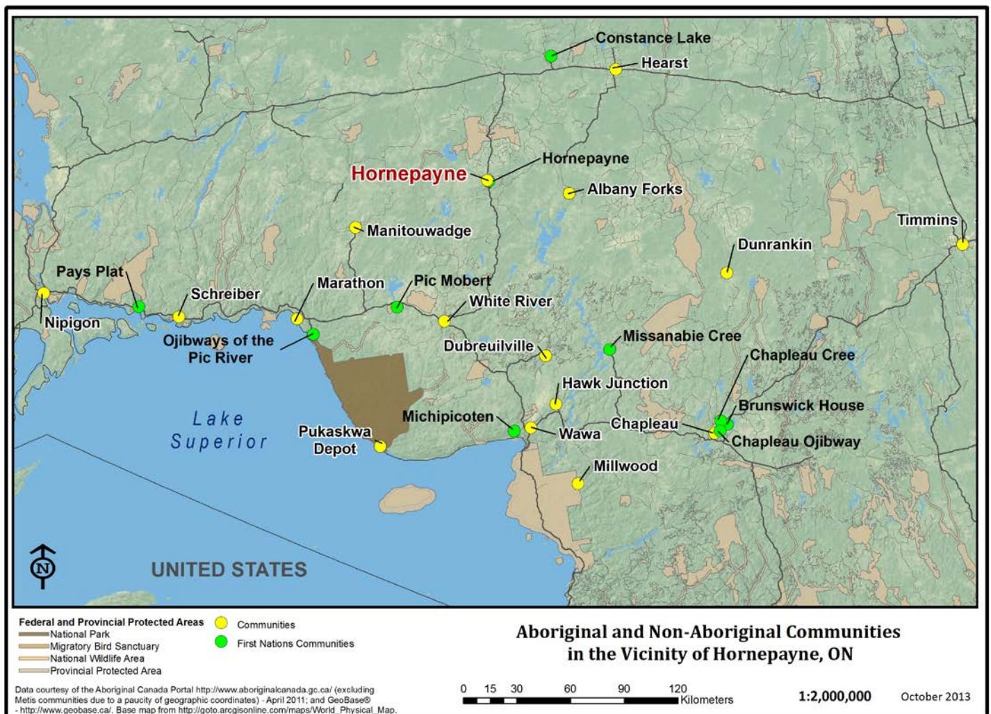
Figure 1: Hornepayne, Ontario

This Preliminary Community Well-being Assessment Report aims to provide a summary of the expected influences that the implementation of the Adaptive Phased Management (APM) Project would have on the overall community well-being of Hornepayne, Ontario (see Figure 1). This report also seeks to answer some fundamental questions to assist the NWMO and the community in understanding the suitability of Hornepayne to move forward in the siting process. While each of the communities currently participating in the ‘Learn More’ process will likely benefit in many ways from the APM Project and the economic development and employment opportunities associated with it, there are certain unique uncertainties and priorities to be managed for each community.