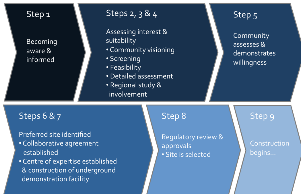
Figure 4.1: Proposed Site Selection Process (from the NWMO presentation to participants)

A more detailed description of each of the nine steps in the site selection process is provided in Appendix B.