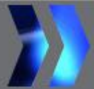
Table Work: Report Back