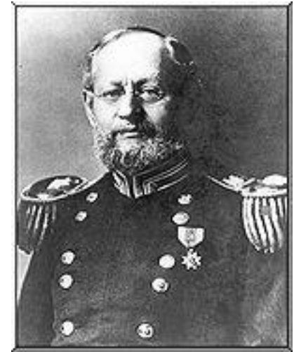
Henry Martyn Robert (1837-1923)