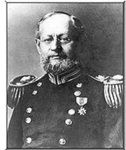
Henry Martyn Robert (1837-1923)