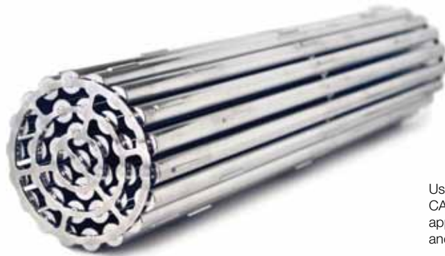
Used fuel bundles from Canada's CANDU nuclear reactors are approximately 0.5 metre long and weigh about 24 kilograms.

A strong sense of responsibility emerged from these conversations. This generation wants to move forward in dealing with our used nuclear fuel, believing it to be imprudent and unfair to future generations to wait any longer.