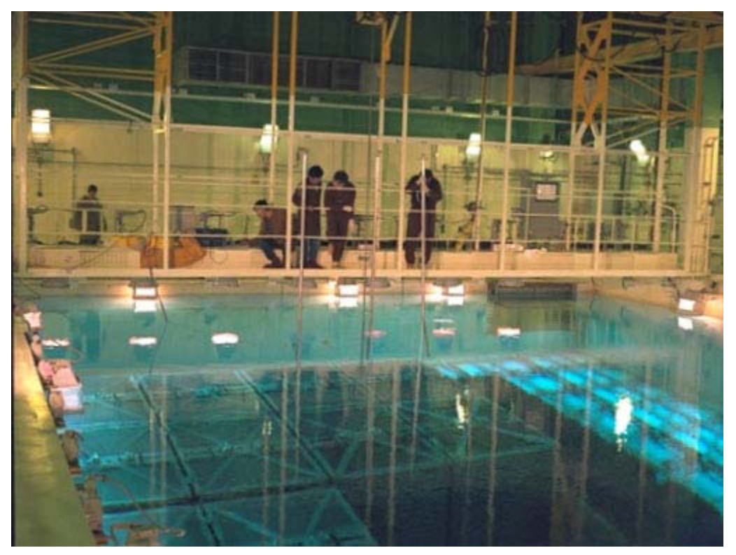
Figure 2-3: Water-Filled Waste Fuel Bay

All nuclear fuel waste is initially stored in water-filled pools. The water provides both cooling and radiation shielding. Cooling is very important as the nuclear fuel waste has an extremely high thermal content when initially removed from the reactor. The water-filled pools or bays are extremely robust. They are constructed of reinforced concrete, lined to prevent leaks and designed to withstand an earthquake.