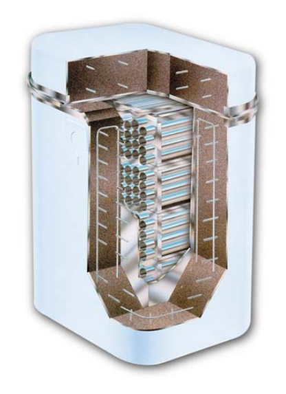
Figure 2-5: Dry Storage Container

For loading, a DSC is placed in the water-filled bay and loaded while submerged in the water. A temporary transfer seal is applied and the DSC is transferred by a specially designed vehicle from the generating station to the on-site dry storage facility where the DSC is purged of water, the lid is welded to the base, the vent port is seal-welded, the DSC is filled with helium and checked for leaks, the remaining drain port is seal-welded and the DSC is transferred to the storage building. DSCs are currently in use at the Pickering Waste Management Facility and at the Western Waste Management Facility (Bruce generating station).