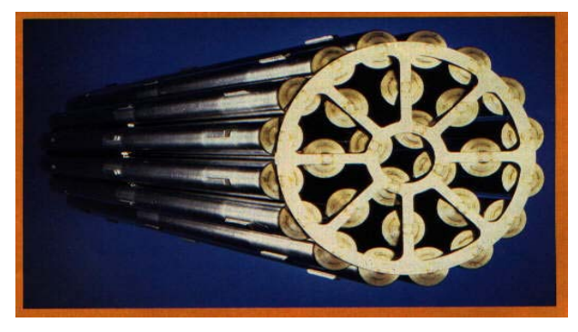
Figure 2-1: CANDU Fuel Bundle

CANDU fuel fabrication creates a fuel bundle that is about the size of a typical fireplace log. The fuel bundle consists of tubular zirconium alloy sheaths containing ceramic uranium oxide pellets. A typical bundle weighs 24 kilograms including approximately 19 kilograms of uranium.