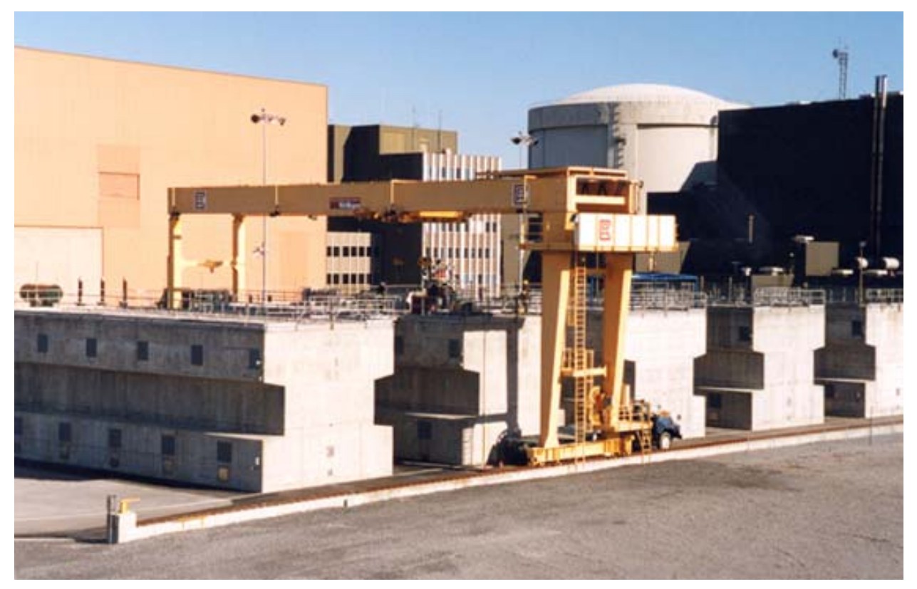
Figure 2-4: MACSTOR System

One AECL-developed system is known as Modular Air-Cooled Storage (MACSTOR). MACSTOR uses a highly efficient heat-rejection system and shielding capabilities to safely store nuclear fuel waste. These concrete units have a double containment system that shields the public and the environment from the radiation being generated by the nuclear fuel waste. The MACSTOR system is in use at Hydro-Quebec's Gentilly 2 generating station.