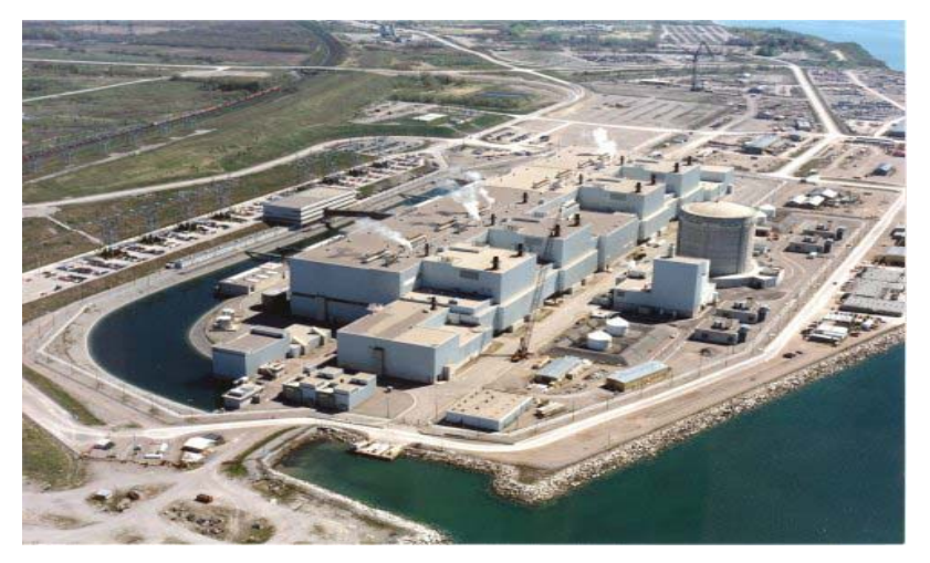
Figure 2-2: Darlington Generating Station (4 CANDU Reactors)

Canada has 22 CANDU commercial power reactors: 20 in Ontario, one in Quebec and one in New Brunswick. At the present time, only 14 reactors (12, 1 and 1) are in operation. Two Bruce A and four Pickering A reactors are scheduled to return to service in the summer 2003.